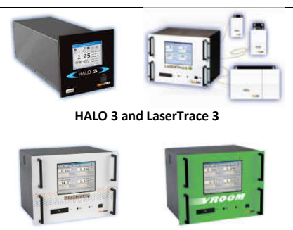
Prismatic and VROOM

Tiger Optics manufactures a range of instruments for purity analysis applications. The HALO 3 is ideally suited to ensure that moisture levels are minimized and controlled while lower levels of both water and other impurities call for the power and sensitivity of the LaserTrace 3. Multicomponent applications are also addressed by both our innovative Prismatic platform and our multispecies mirror-based analyzer, the VROOM.